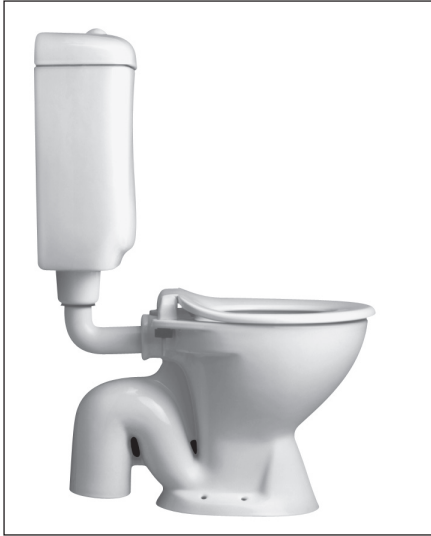
Junior 200 'S' trap connector suite shown

The Junior 200 connector toilet suites incorporate a reduced height toilet pan specially designed for infants. A new generation in water-saving technology sanitaryware product, the Junior 200 connector toilet suite uses Caroma Smartflush technology to deliver a 4.5/3 litre dual flush vitreous china toilet suite system.