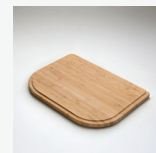
AC15 Bamboo Board