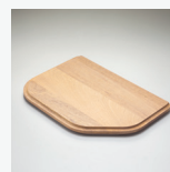
AC65 Bamboo Board