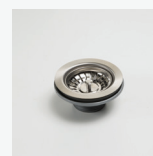
AC14 Basket Waste