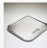
AC63 Utility Tray