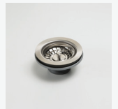
AC14 Basket Waste