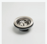
AC14 Basket Waste