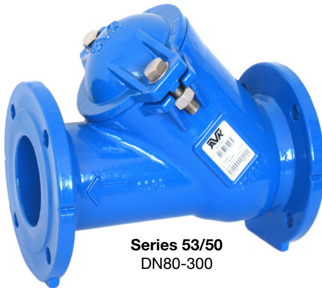
Series 53/50 DN80-300