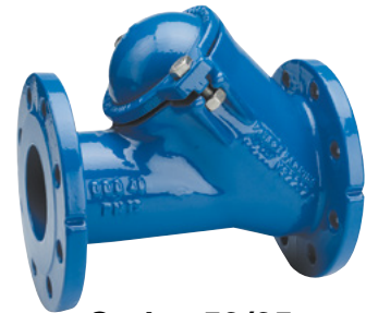
Series 53/35 DN50 & DN65